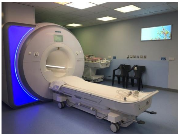
Figure 2. An MRI scanner

The MRI scanner is like a long metal cylinder and most of your body will need to go into it (see Figure 2). Some people may find that slightly claustrophobic. Therefore, if you suffer from claustrophobia, MRI is unlikely to be suitable for you.