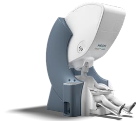
Figure 3. A MEG scanner

The MEG system contains very sensitive detectors arranged around a helmet shaped hollow (see Figure 3). Brain activity is measured from a participant as they sit with their head inside this hollow. Because the magnetic signals produced by brain activity are tiny compared to those produced by the earth and electrical equipment, the scanner is in a specially built room that keeps out magnetic fields from the environment. During the MEG scan you will be in a quiet, dark room.